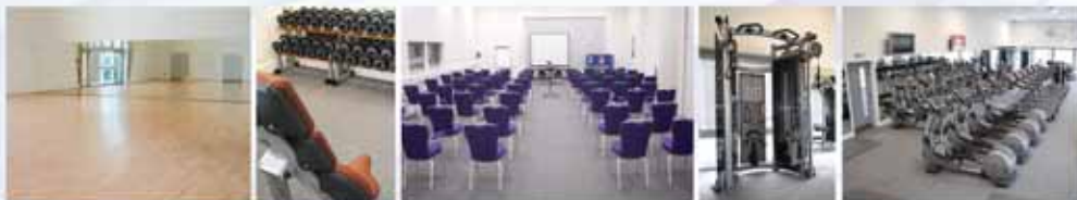
Everest Health & Leisure Club

Four Court Sports Hall Floodlit Astro & MUGAs Junior & Senior Football Pitches Oversized & Mirrored Dance Studio