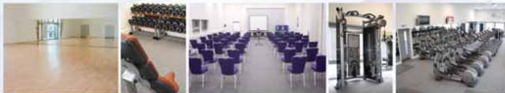
Everest Health & Leisure Club

Four Court Sports Hall Floodlit Astro & MUGAs Junior & Senior Football Pitches Oversized & Mirrored Dance Studio