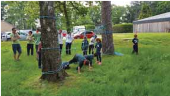
Pictures from Cub Summer camp Youlbury Scout5 Activity Centre

The scout troop also visited the RAF Museum at Hendon and are looking forward to more camping later in the summer. Join the adventure – weekly meetings Base 2000 Carpenters Down, Popley RG24 9AE