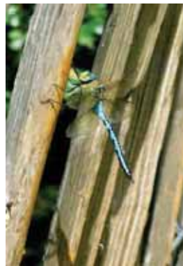
Emperor Dragonfly at Popley Ponds