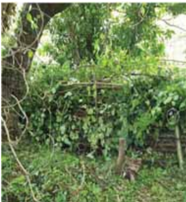
New Hedge at Popley Ponds.

Our regular sessions (final Saturday of each month) will have restarted by the time this article is published. New members or occasional attendees are always welcome. We will be putting together some nature events (including the popular bottle trapping) over the season, if you would like to know more about the wildlife at the site, further details will be publicised on our Facebook page or via email (see contact details below).