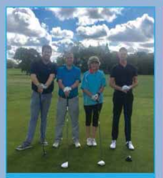
SMH & TC Golf Day 14<sup>th</sup> September