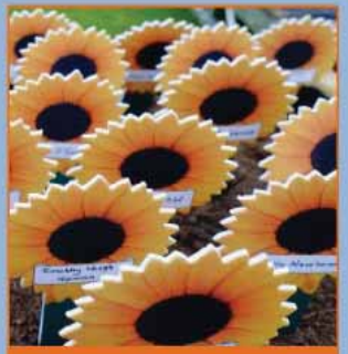
Sunflower Service 10<sup>th</sup> June