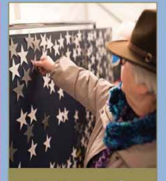
Light up a Life 2<sup>nd</sup> December