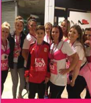
Moonlight Walk 13<sup>th</sup> October