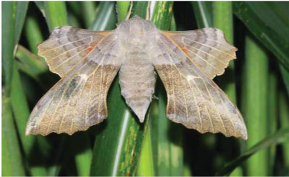
The distinctive Poplar Hawk Moth. Photo taken in a Popley garden

11 August is National Moth Night. Popley Conservation Volunteers will be holding a moth trapping evening. On the same evening they will also be conducting a bat survey using bat detectors.