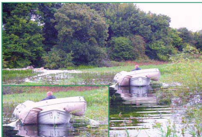
Come in number 13. Unlucky for Popley Ponds. Some idea of the size of the bales can be seen from this photo.

Below is a sight you would not expect to see in Popley and not a sight we would hopefully ever expect to see again.